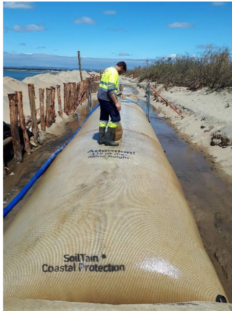
Pic 3 (HUESKER_SoilTain Tube filling in Ayamonte):

Filling of the geotextile SoilTain Tubes in Ayamonte/Spain