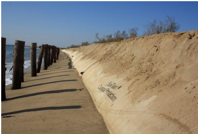
Pic 2 (HUESKER_Project Ayamonte Spain):

Areas of application for geotextile HUESKER SoilTain Tubes or Bags