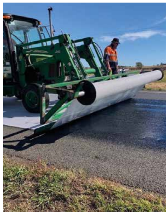
HUESKER chipseal grid installation on the existing surface Unrolling and installation were simply carried out by using an installation frame followed by the bitumen seal application.