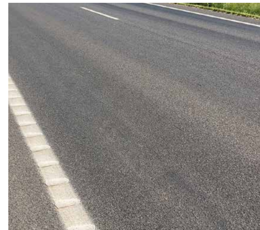
HUESKER chipseal grid section The section of the highway reinforced with chipseal grid is showing no reflective cracks and no surface defects. The seal is performing significantly better in this section and the pavement remains in good condition, as verified by the Road Authority.