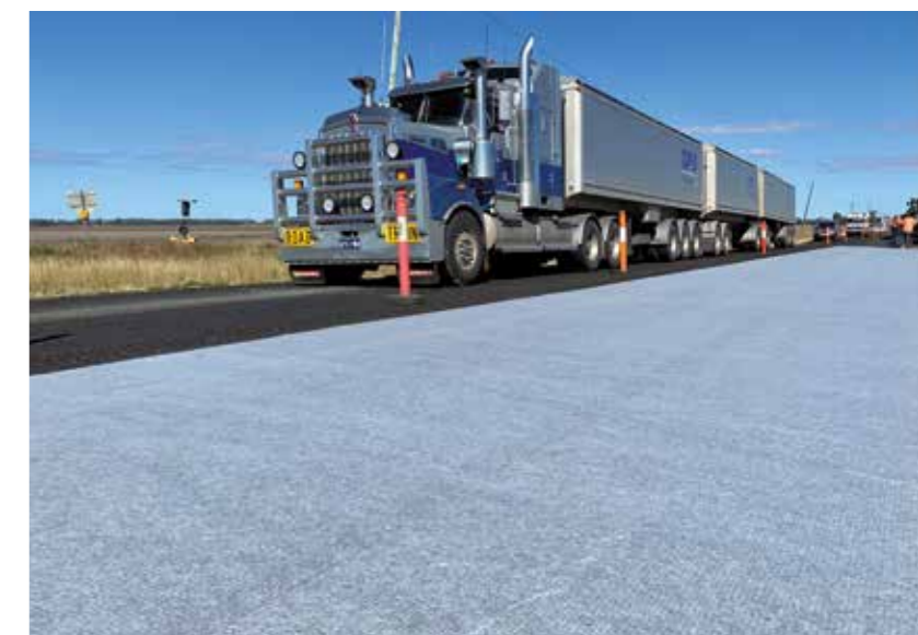
Installed chipseal grid Chipseal grid placed onto a bitumen Bond Coat, prior to the application of the Seal Coat