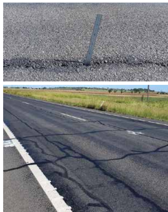
Condition prior to double/double seal Prior to the reseal the road surface was in a poor condition showing severe cracks and surface defects. Large cracks were enabling water intrusion into the pavement structure and causing its deterioration, and requiring frequent crack sealing.