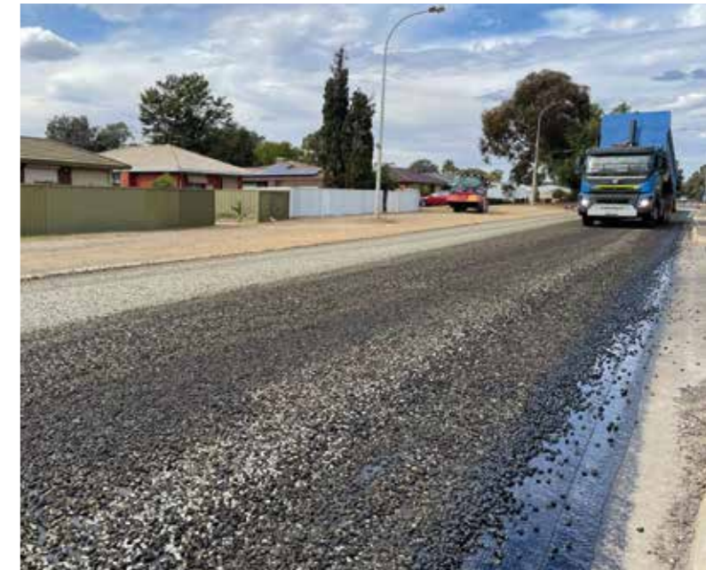
Chipseal grid covered with spray seal