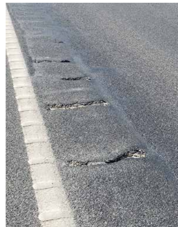
Control section (without reinforcement) One year after the reseal, the control section is showing reflective cracks and surface defects, in addition to signs of bitumen migration. This section had to be repaired since.