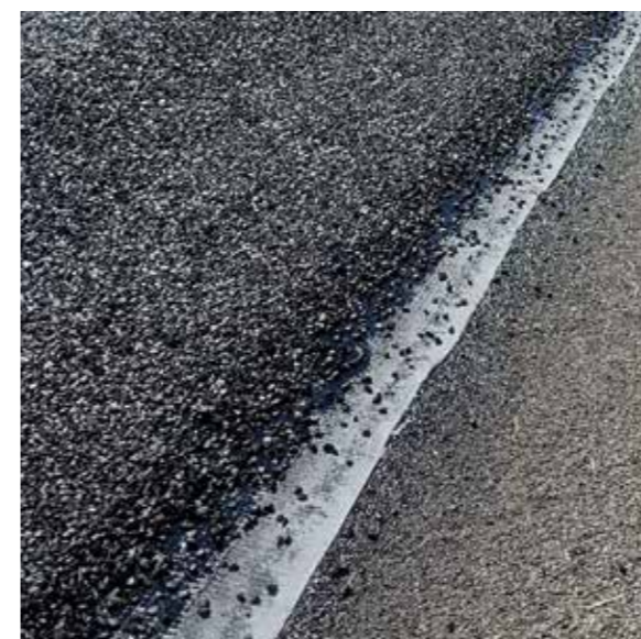
Spray seal construction Constructed double/double sprayed seal above chipseal grid.

HUESKER chipseal grid effectively delays pavement deterioration and extends the service life of spray seal pavements. For further information about the HUESKER product solutions – chipseal grid – please visit our website or contact us directly.