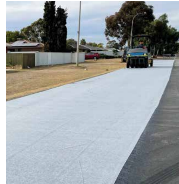
Chipseal grid installation