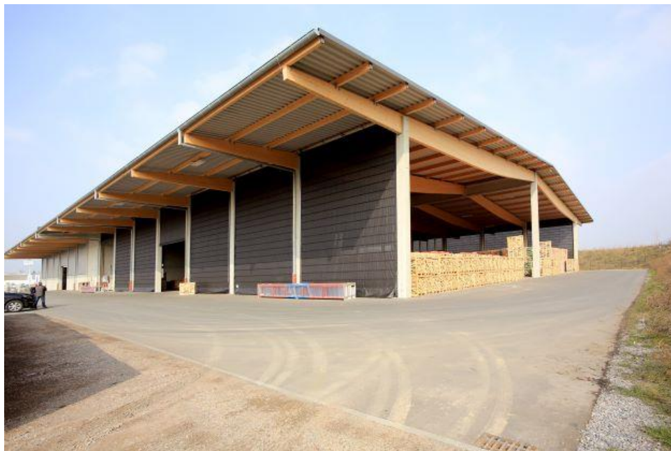
Image 2: Solutions for large openings and a long service life characterise the products

You can download the images in print resolution here: